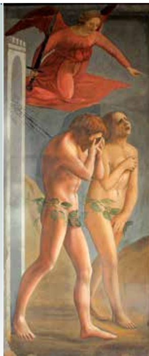
This reproduction of "The Expulsion from the Garden of Eden" by Masaccio appears in the Nicholas Lochoff Cloister of the Frick Fine Arts Building.