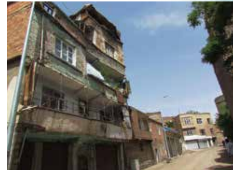
An example of informal housing from the Sur district of Diyarbakir, Turkey, June 2016